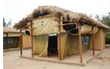
Eco Camp calling!

GENERAL ADMINISTRATION POLITICS INDUSTRY ENVIRONMENT TOURISM CULTURE SPORTS RELIGION EDUCATION HEALTH LAW & ORDER BANKING INFRASTRUCTURE AGRICULTURE MEDIA FINANCE