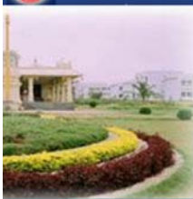
Gajapati, Orissa, INDIA.