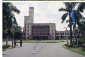
IIM Lucknow and IIT Kharagpur

Technology in Bihar and Rajasthan and Indian Institutes of Science for Education and Research (IISERs) in Pune and Calcutta.